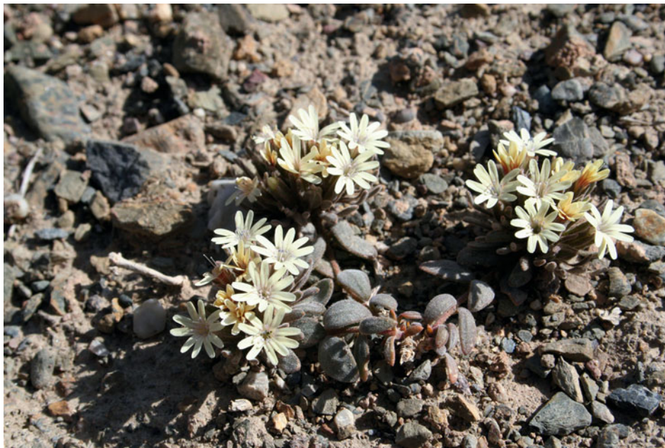
FIG. 1. Ochotonophila flava growing in the type locality. Photo by M. Jacobs, 3 vi 2008.

Perennial herb, growing in small tufts, 3–10 cm tall. Taproot to > 25 cm long, 5 mm wide, branching at or subsurface into a pleiocorm. Annual stems few (1–5), procumbent or ascending, unbranched and each terminating in an inflorescence, easily disarticulating at nodes (especially in dried condition), with 4–6 leaf pairs. Indumentum of all green parts dense, consisting of two hair types: eglandular hairs 0.1–0.25 mm long, ± patent, curved, and glandular hairs , more numerous in the inflorescence, 0.2–0.5 mm long, with a slender multicellular stalk and a terminal globose secretory cell to 50 µm in diameter. Leaves spreading or ± reflexed, elliptic, 7–11 × 3.5–6 mm, acute, basally cuneate and shortly connate by a hyaline membrane, carnosae, pale bluish- or greyish-green, with prominent midvein and two laterals. Inflorescence densely cymose, ± semiglobose, to 5 cm in diameter, with up to c.40–50 shortly pedicellate, bracteate flowers. Bracts dissimilar to stem leaves, 10–15 × 0.5–2 mm, the lower oblanceolate, the upper linear. Calyx tubular, 7–12 × 2–3.5 mm, membranous except for 5 prominent green