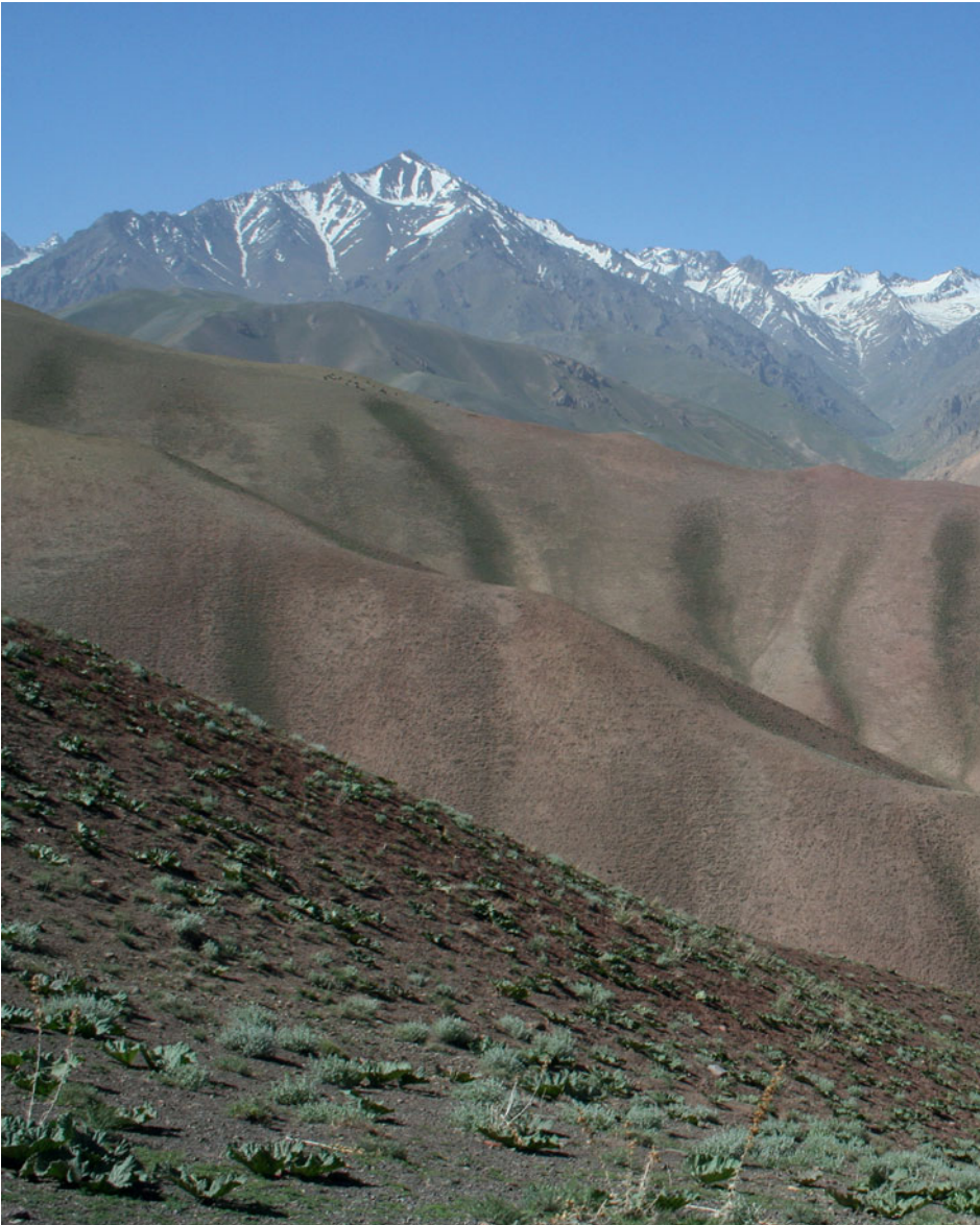
FIG. 3. Habitat of Ochotonophila flava : dry slopes with Phlomis parviflorum and Rheum ribes dominating. View south towards the Koh-e-Baba range. Photo by M. Jacobs, 3 vi 2008.

Proposed IUCN conservation category. This tiny but relatively conspicuous species was not observed during the many previous collecting expeditions to Bamiyan Province during the 1950s to 1970s. Subsequent to its discovery in 2007, two parallel ridges with similar ecological conditions were searched for the species by members of the Afghanistan PEACE Project without success. Consequently, it appears that